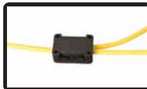
Tracer-Lock TWC Tracer Wire Connector